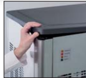
ABS plastic top cover